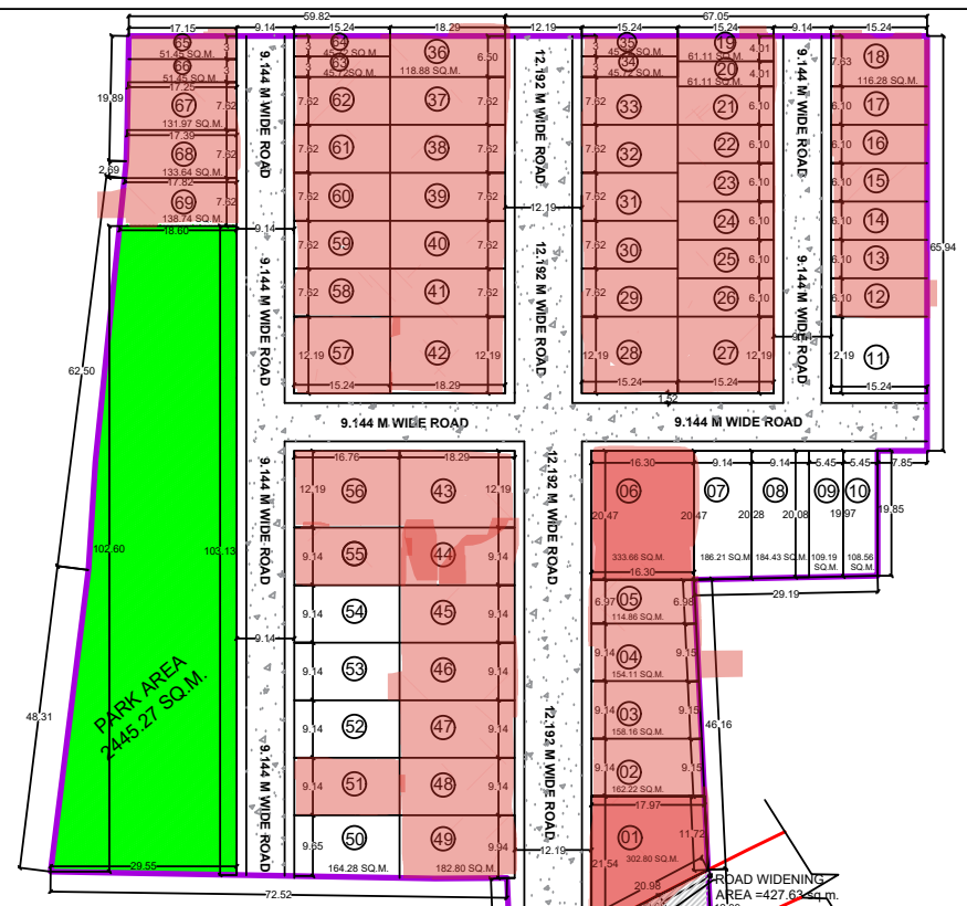
LAYOUT PLAN SCAL 1:500